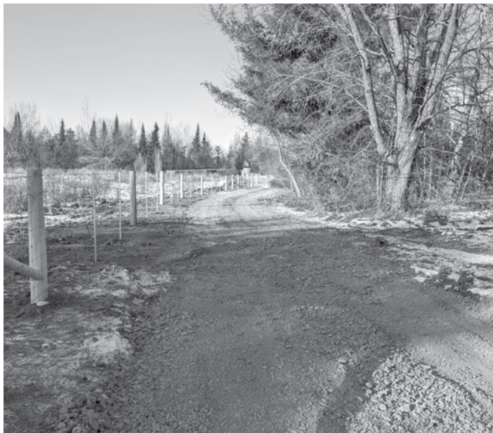
NCC pathway near Tauvette St

Neighbourhood Watch Program. The videos depict the merits and benefits of the program and how it makes communities safer. Check them out on their YouTube channel, and contact safety@blackburnhamlet.ca to learn more.