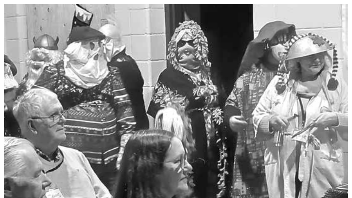
Our Mummers on display!