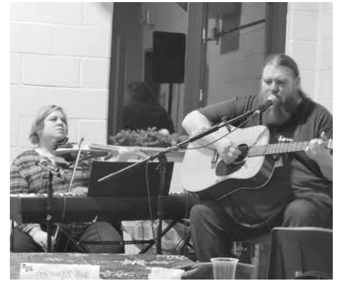
Mason's Apron provided great entertainment!