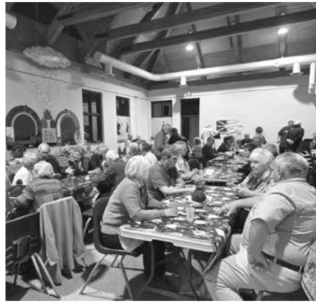
Thanks to all who joined in the fun.