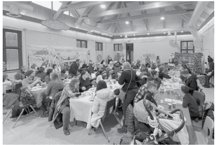
It was a full crowd at all three sittings.