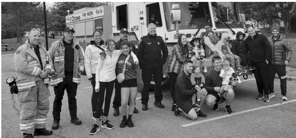
Thanks to Ottawa Fire Services for stopping by!