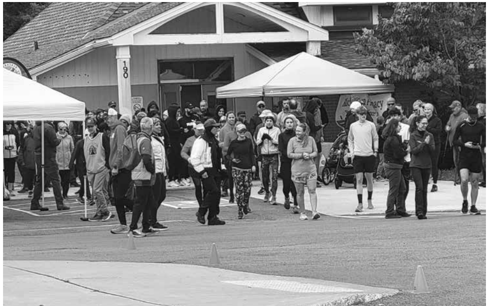
And they're off!