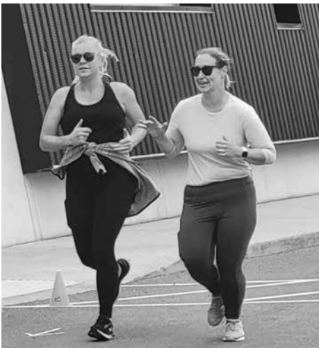
Two runners approaching the finish line