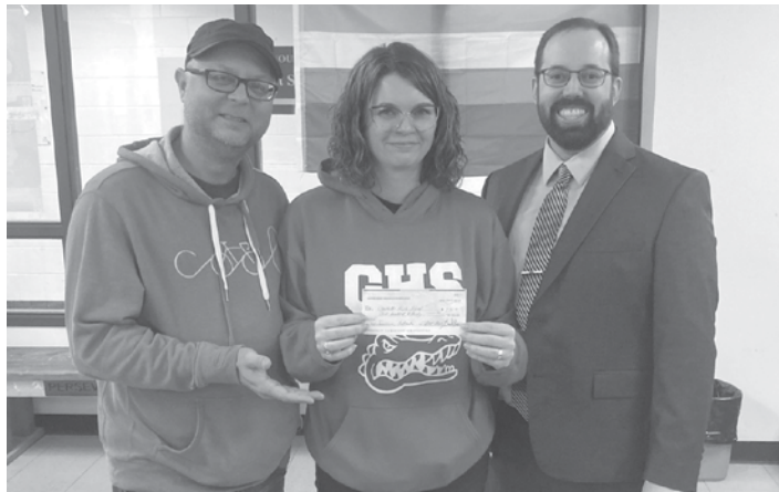
Gloucester High School