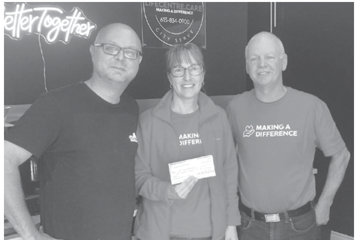
Life Centre Food Bank