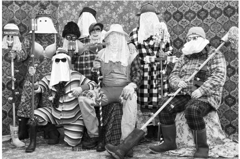
Mummers