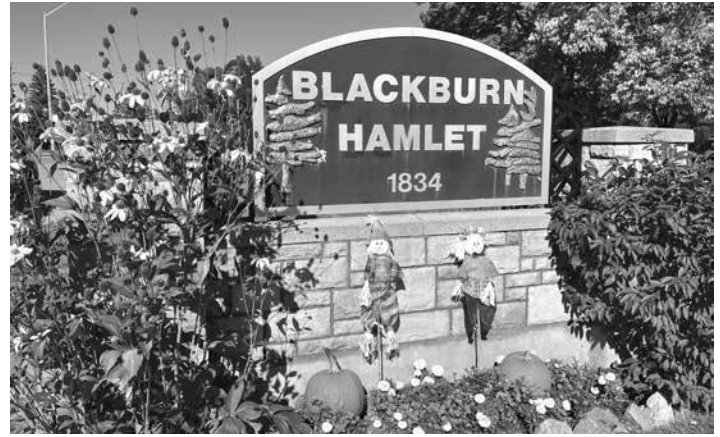
BCA garden set for fall