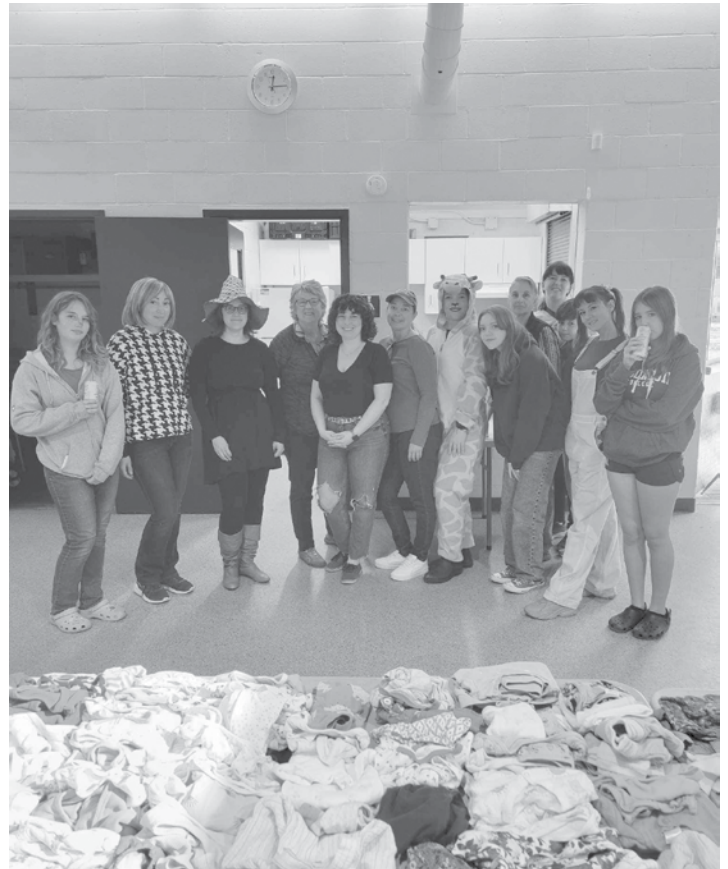
Thank you to the volunteers who made it all happen!

Events like these are a great way to bring the community together, support sustainable practices and get some new clothes for the family, but they take a lot of planning and hard work! Our thanks go to the organizers and volunteers who accepted donations, sorted and folded clothes, transported them to the hall, set up and took down tables, helped shoppers find what they were looking for, playing with the kids, and so much more. This event would not have been possible without each of you! And special thanks to all who donated and dropped off items of clothing to our volunteers.