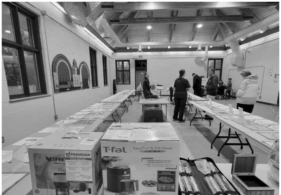
The silent auction was a great success.