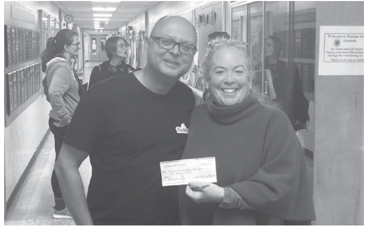
Norman Johnston Secondary Alternate Program

See honouairum distribution list on page 12