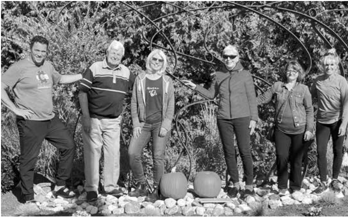
Thanks to the watering crew!