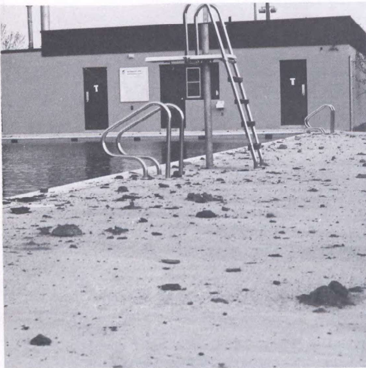
Rocks, clods of earth, sticks, bottles and assorted debris thrown into and around the pool.

The president then thanked the executive for assisting him in during the past year and wished the new executive all the best in the coming year.