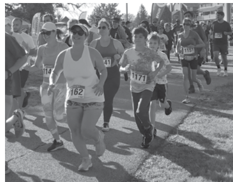
See Cancer Chase, pages 14 and 15