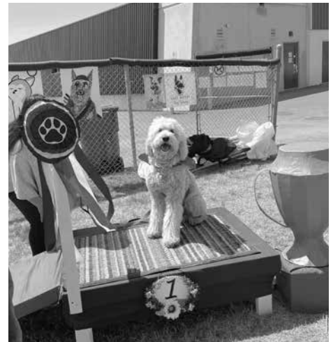
A winner from the FunFair Dog Show