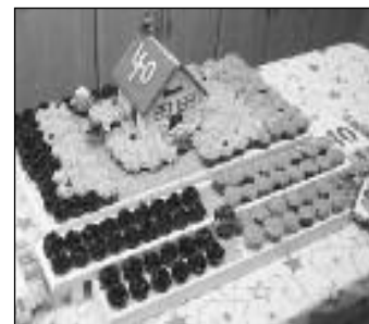
Delicious cupcakes donated by Sweet Cakery - www.sweetcakery.org