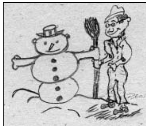
Illustration by Brian Finn