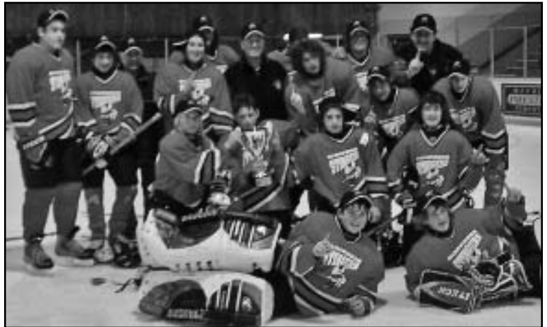
Congratulations to the Blackburn Bantam A Stingers who went undefeated in Gloucester Tournament on January 8, 2006.