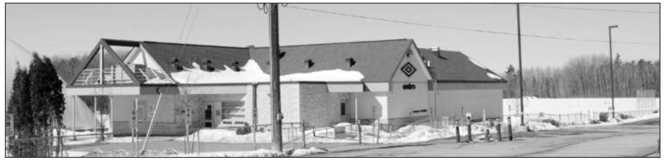
The Cancer Chase will start and finish at the Eric Danis Clubhouse, Hornets Nest, 1660 Bearbrook.

Contribute what you can. T-shirts will be available for sale, depending on supply, with priority to Running Room registrants.