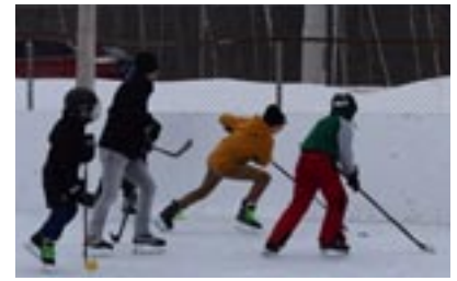
Hockey Day in the Hamlet 2020