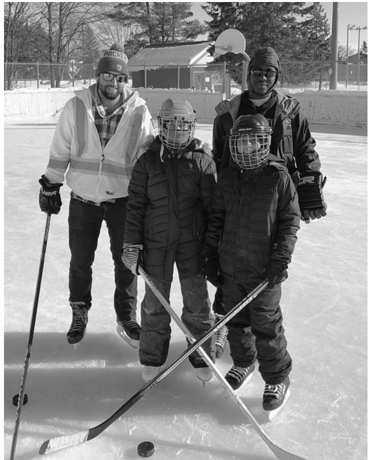
In spite of the cold weather skaters had fun on the Emily Carr Rink.